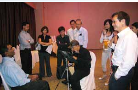
Caricature at work